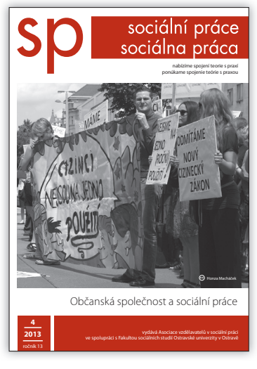
Civil Society and Social Work

ISSN 1213-6204 (Print) ISSN 1805-885x (Online)